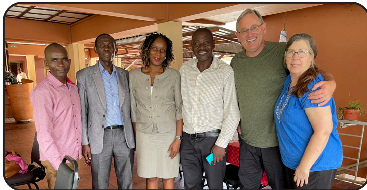
Staff & Board Members in Uganda

both Adam & Eve dormitories and the new main office bathrooms. Renovations are now underway in the downstairs offices next to the display room.