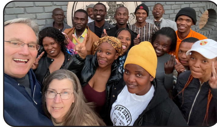
Staff & students in South Africa

New staff have arrived for which we are SO thankful. We also welcomed eight new Sojourner students this term. Praise the Lord! Our staff just concluded our annual Staff Retreat. We debriefed our summer operations and looked at ways to improve our program moving forward. We are now finalizing our 2025 summer trip listing and have begun receiving applications. Property renovations are moving forward with the completion of