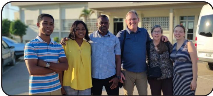
The staff in Madagascar

Our summer teams returned with joy much like the 70 disciples Jesus sent out in the gospel of Luke. We saw answered prayers all along the way. Five made decisions for Christ at Boot Camp and we saw three more teen teams go out in 2024 than the year before. To God be the glory! Please take time to visit our team reports page for lots of great testimonies from this summer. Our Teen Missions Youtube channel has the daily 2024 Boot Camp videos and rallies. The TMI Facebook page has photo galleries from this past summer. Enjoy!