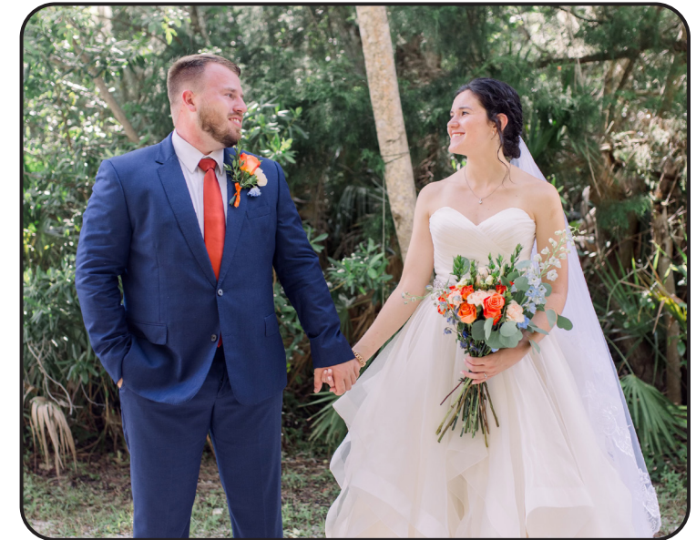
The Wedding — August 10th