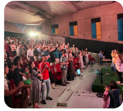
way. For me, it was decisions made regarding the health of our team.

But in all those situations, we were so blessed to continually feel and see the outcome of people praying for us. So many times while we were gone we would experience a situation that only got resolved because of God answering the prayers of His people.