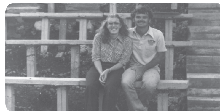
On Our First Team Together 1981

Together we have led 35 teams of teenagers around the world and have been in 43 countries. Our teams have built amphitheatres, clinics, churches, airplane hangers, dormitories and done landscaping. We have drilled wells, had foot-washing teams, eyeglass/medical teams and have done